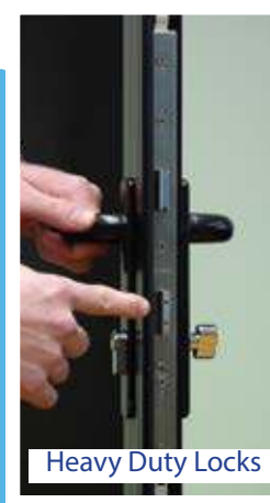
Heavy Duty Locks