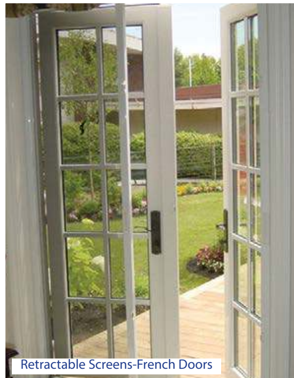
Retractable Screens-French Doors