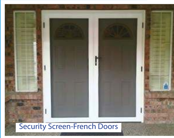
Security Screen-French Doors