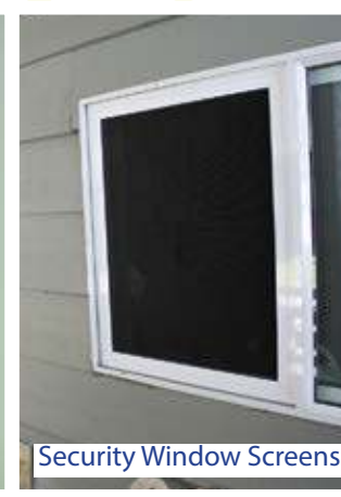
Security Window Screens