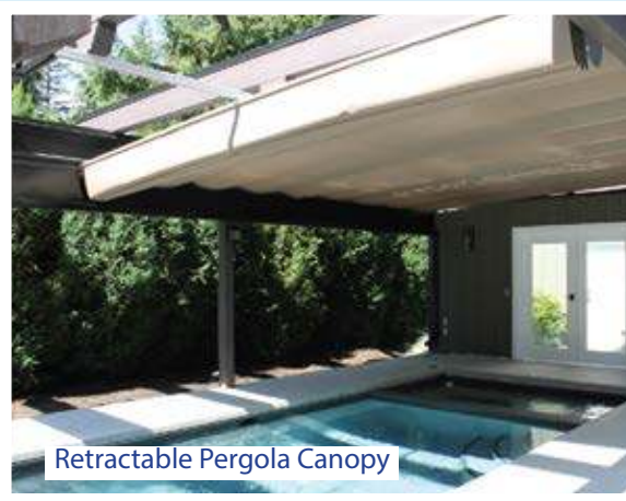
Retractable Pergola Canopy