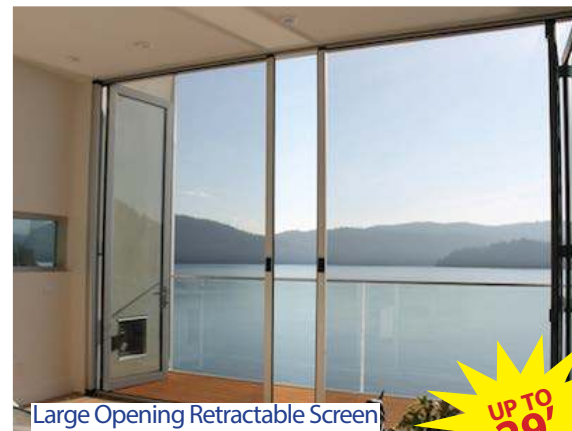
Large Opening Retractable Screen