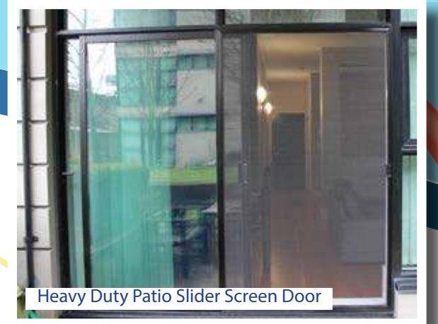
Heavy Duty Patio Slider Screen Door