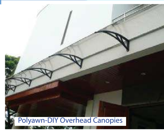
Polyawn-DIY Overhead Canopies