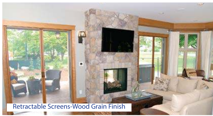
Retractable Screens-Wood Grain Finish